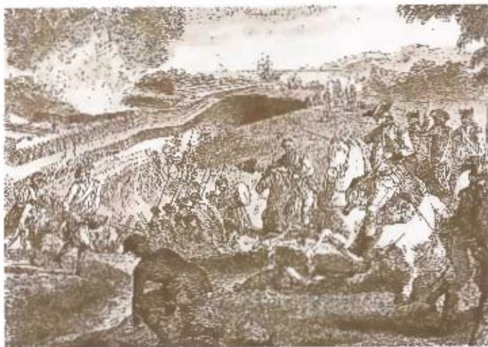
Battle of Pensacola, 1781

Florida, with its seat at Pensacola, and East Florida, with its capital at St. Augustine. British surveyors mapped much of the landscape and coastline and tried to develop relations with a group of Indian people who were moving into the area from the north. The British called these Creek people "Seminolics" or Seminoles. Britain attempted to attract white settlers by offering land on which to settle and help for those who produced goods for export. Given sufficient time, the strategy might have converted Florida into a flourishing colony, but British rule lasted only twenty years.